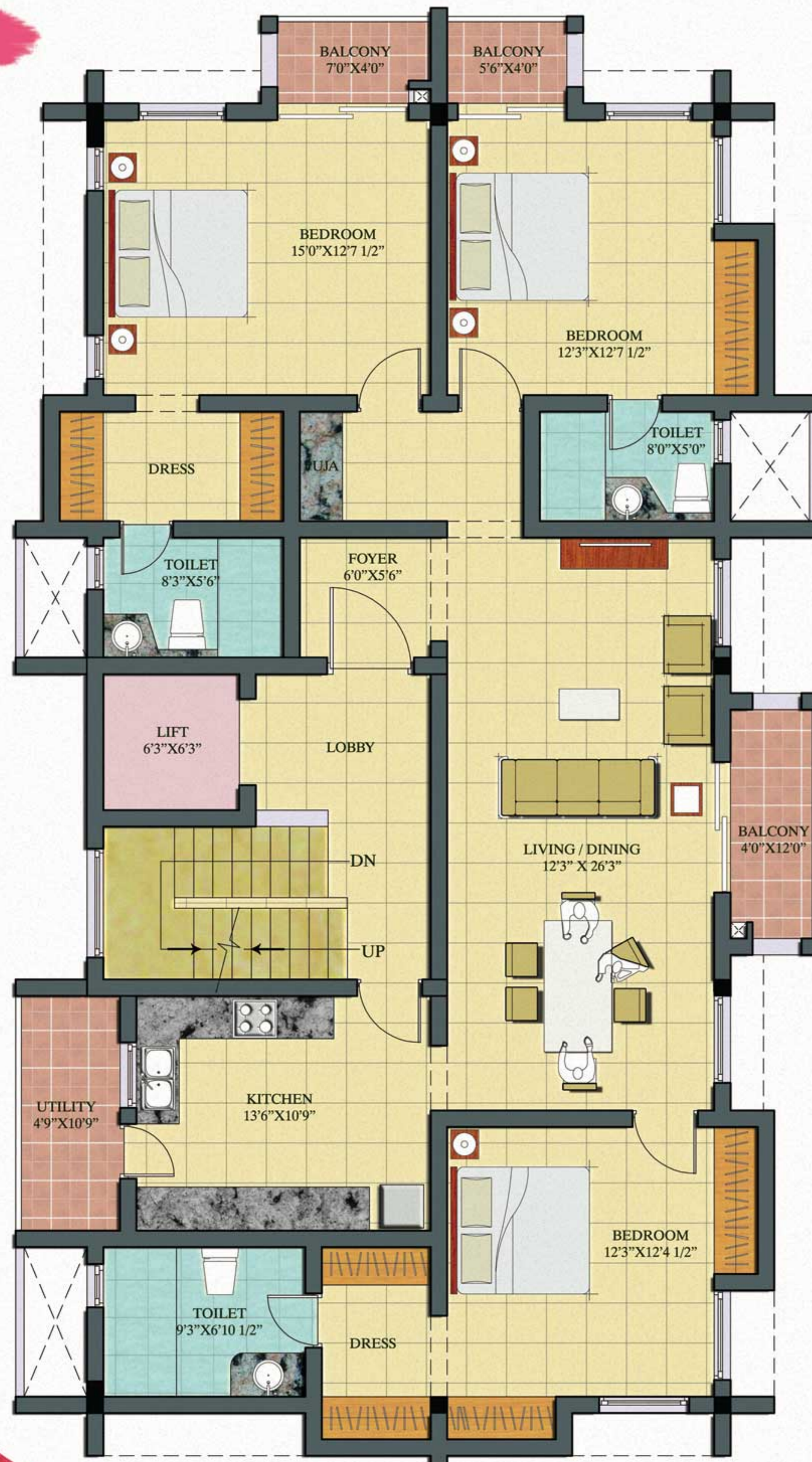
Typical Floor Plan - 3BHK 2214 Sq.Ft.